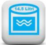
Upper Tank Drinking Water