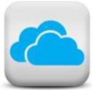
Min Humidity RH 30%