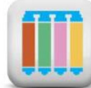
Pre and Post Carbon Filters