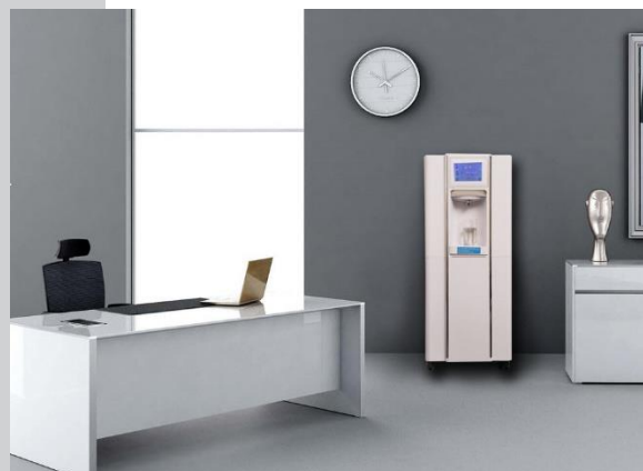
WS-30 up to 30 Liters per Day