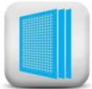
Electrostatic Air Filter