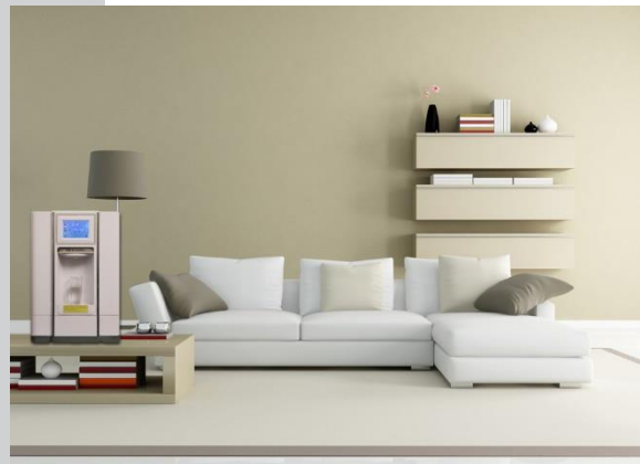
WS-15 up to 15 Liters per Day

CHEMICAL AND MICROBIOLOGICAL ANALYSIS The samples are comply with the Legislative Decree N° 31 02/02/2001 - GU n°52 03/03/2001 About the potability of water intended for human consumption- Laboratory ACCREDIA n° 0353 Test Report N. 272/S14 date 10/02/2014 Sample taken at FAO - Food and Agriculture Organization of the UN - Via Terme di Caracalla , Roma