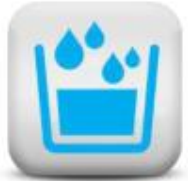
Bottom Tank to collect water