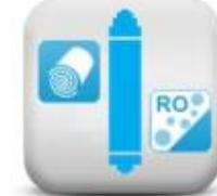
Reverse Osmosis Membrane