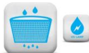
Carbon and Zeolite Filter